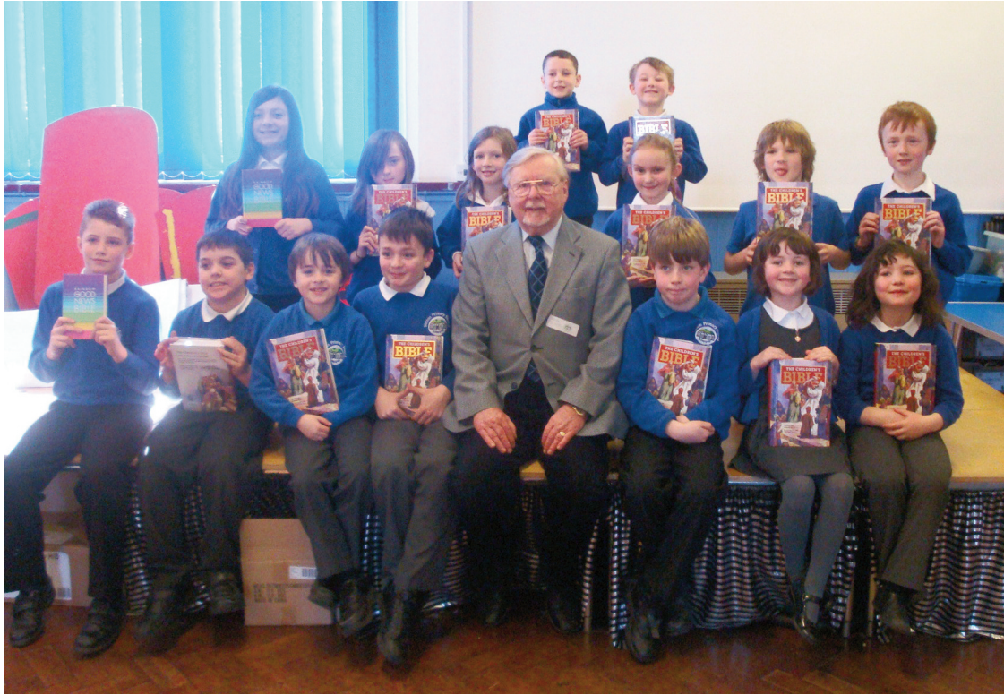
The Chairman with children at Welton Primary School, near Bath.